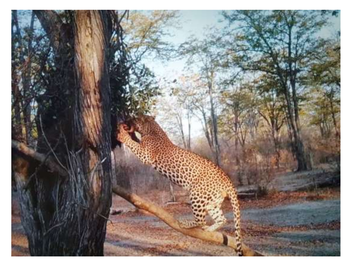
Our other 5 leopards have gone without a hitch apart from one that nearly scratched me! All 4 cats were beautiful males and we look forward to the next up and coming leopard hunts.