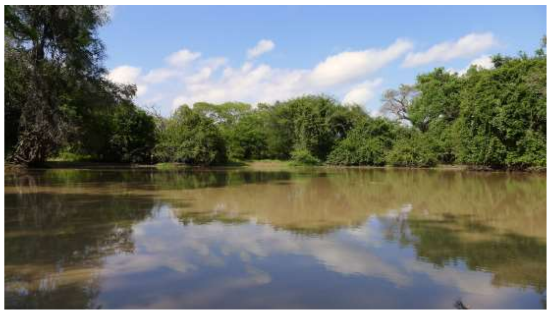
Pans full with heavy rains

As we approach the end of the first quarter we look back on what has been a hard but in many cases productive few months of hunting. The "hard" part came about due to unbelievably heavy and late rains in April. Normally the roads and camps are open by end of April but with 13 " of rain in mid April all the roads we had painstakingly fixed were washed away and camps flooded for the second time!!!