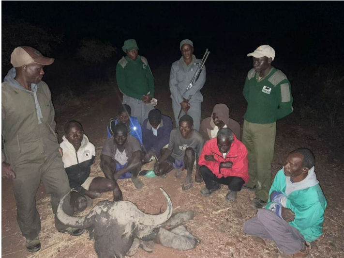
<u>DAPU</u> - As many of you know, with the kind help of some individuals and organisations CMS funds and runs DAPU, The Dande anti-poaching unit. DAPU as its name implies operates in the Dande - as we speak we have 9 meat poachers in the dock awaiting hopefully sentencing! DAPU has had a very busy year so far visit: www.dapuzim.com to donate!

On another note, we have relaunched our website <a href="www.cmsafaris.com">www.cmsafaris.com</a> as we felt that it was not so user friendly. We would appreciate if you looked at it and emailed us any constructive criticisms you may have. You will notice a few specials available for this year which are very good deals and we hope someone may well take advantage of this!!!